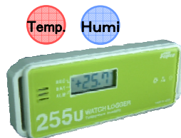
KT-255U Embedded sensor type (Open price)

Temperature recording of cold chain/Temperature and Humidity control in warehouse or green house