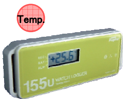
KT-155U Embedded sensor type (Open price)