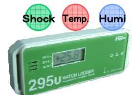
KT-295U Embedded sensor type (open price)

Possible to identify the exact time of drop or collision !