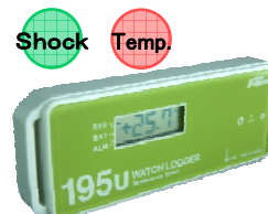
KT-195U Embedded sensor type (open price)