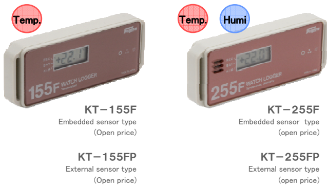
KT-155F Embedded sensor type (Open price)