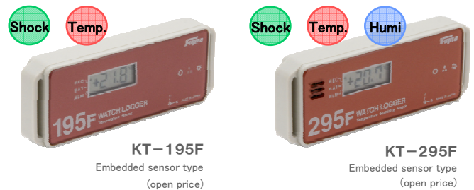
KT-195F Embedded sensor type (open price)