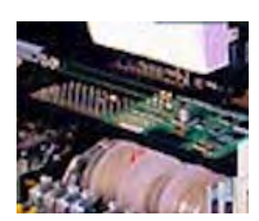
Semiconductor manufacturing process