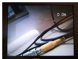
Bright Room (LED OFF) 12cm to the connector 40cm to the back wall