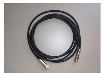
3m : ¥12,600 (tax in) 5m : ¥18,900 (tax in) 10m : ¥27,300 (tax in)