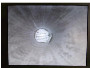
LED illumination inside a Stainless steel p Pipe Inner Diameter: 33mm Length 20cm