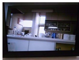
Well-lit Room (LED OFF) Indoor Scenery Subject distance 5-6m